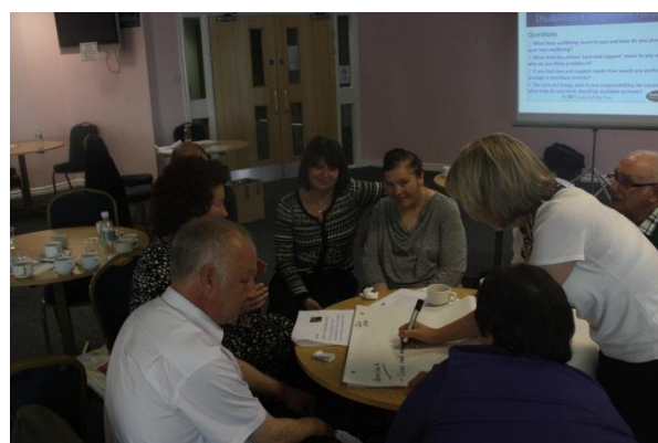
County Durham Adults Learning Disability engagement forum

A specific event for people with learning disabilities, carers and organisations was held in November 2014, which focused on a number of themes, including social activities and health. The engagement tools used on the day were designed by the people with learning disabilities. The engagement approaches took into account the different needs of individuals with learning disabilities to enable people to have their say.