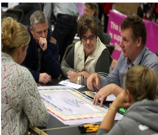
AAP consultation event

Further work will take place at a local level through Area Action Partnerships and will be progressed through the Community Wellbeing Partnership, which is a sub-group of the Health and Wellbeing Board.